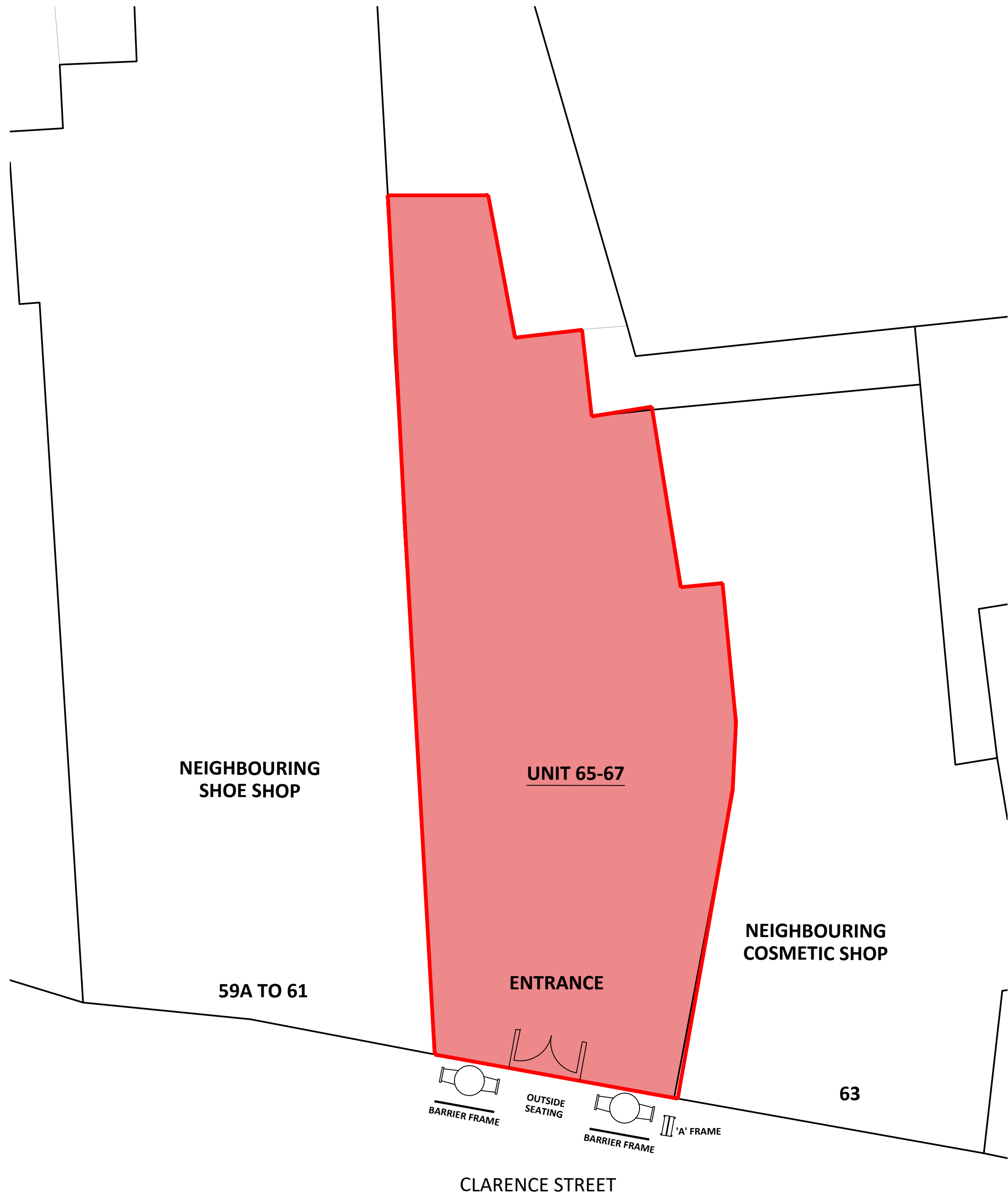
PROPOSED UNIT PLAN SCALE: 1:100