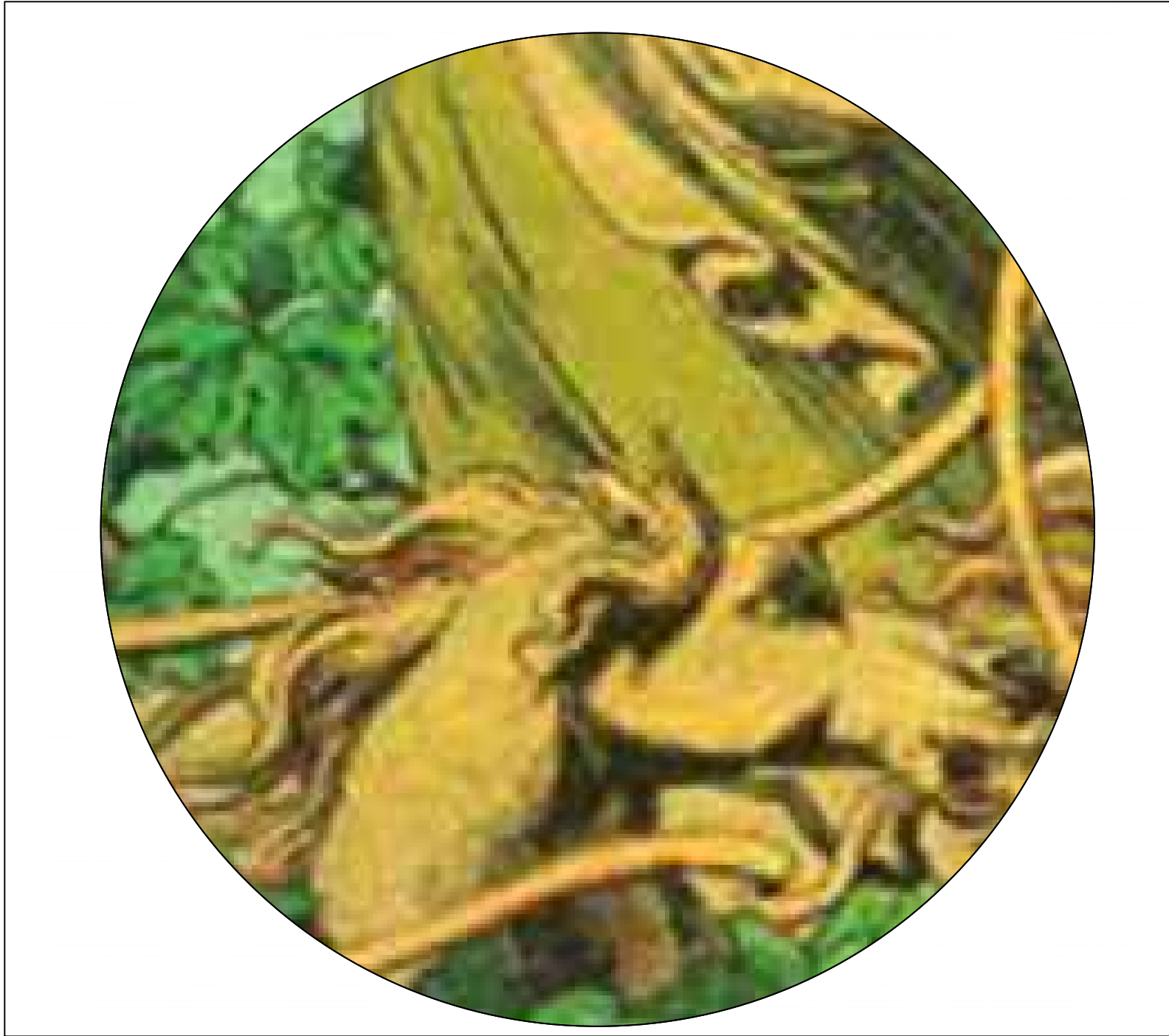
PROPOSED TABLE TOP DESIGN SCALE: 1:5