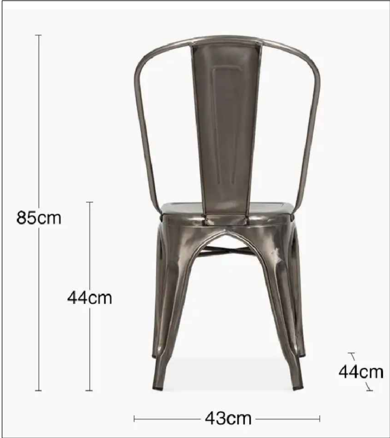
PROPOSED CHAIR DESIGN DETAIL