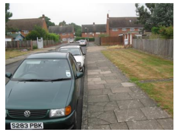
Barnfield Gardens access road