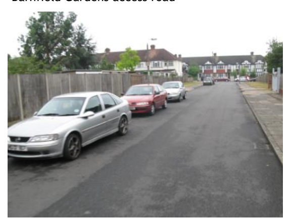
Barnfield Gardens access road