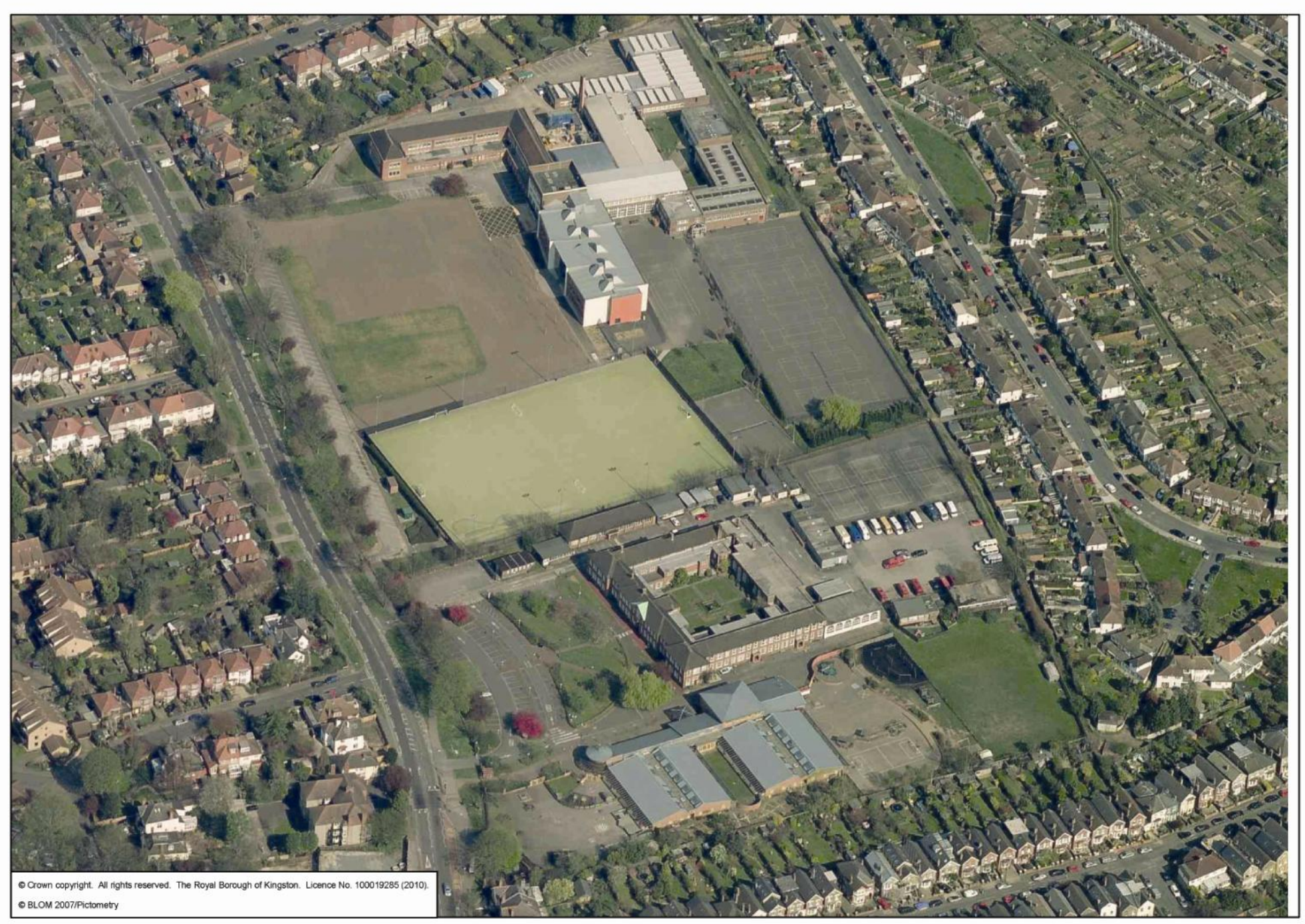
Character Area 13; birds-eye view from the south