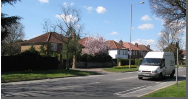
Housing opposite the North Kingston Centre