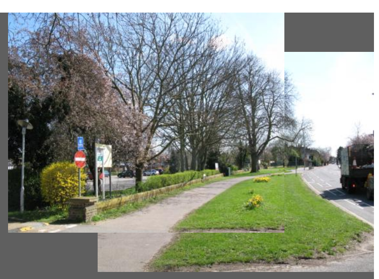
Verge between NKC and Richmond Road