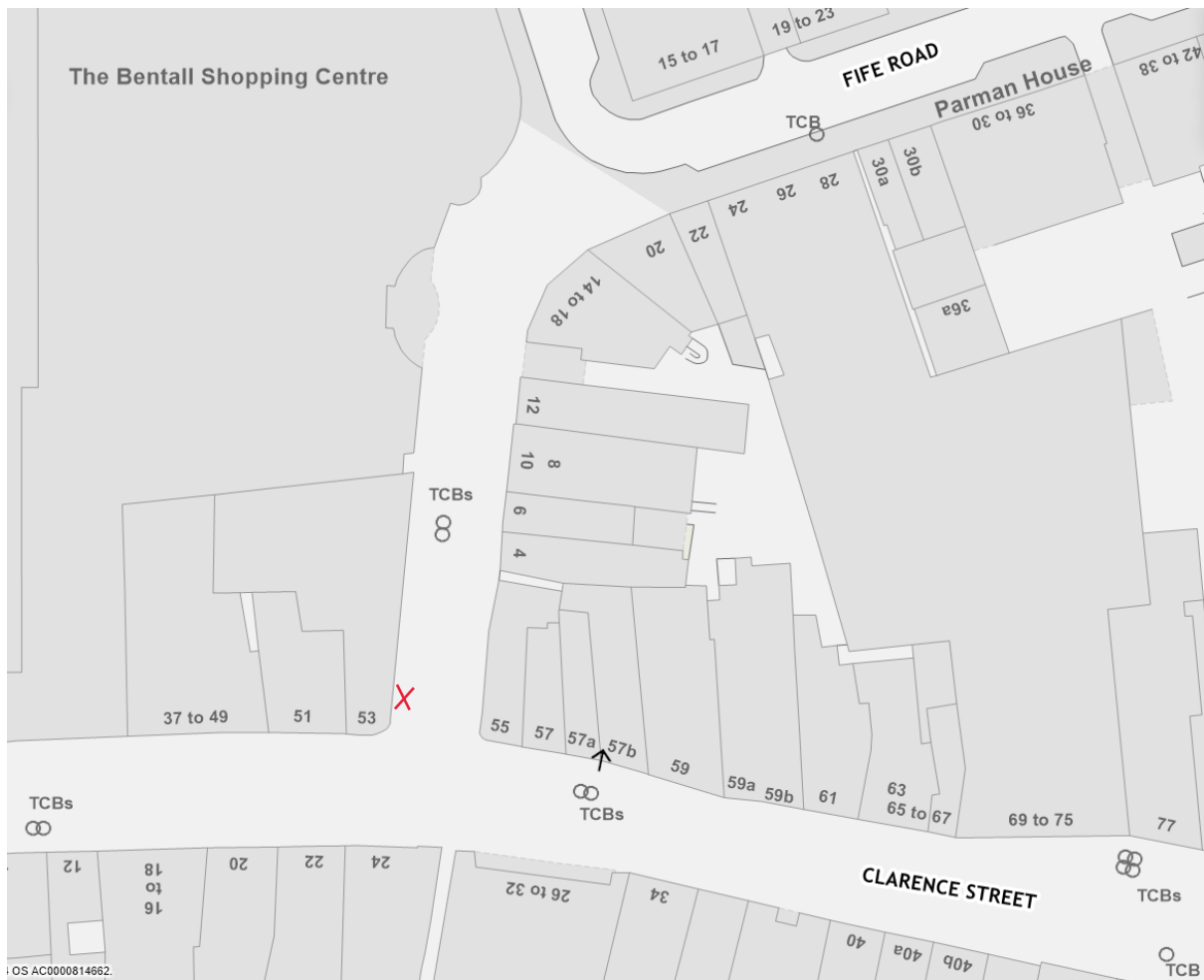
Existing pitch 1012, Fife Road, Kingston upon Thames