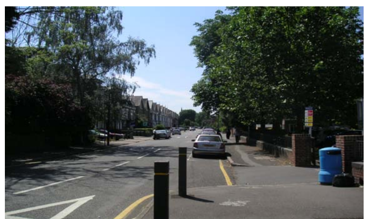
Long View of St Marks Church, Surbiton; Grove Lane/ Fassett Road roundabout

6.48 Fassett Road has a more open character than Beaufort Road due to the larger modern University buildings set back on the west side of the road. These contrast with the regular form of the buildings on east side of Fassett Road looking south. The vista on the horizon of St Marks Church in Surbiton also provides an interesting focal point (See Plan 7).