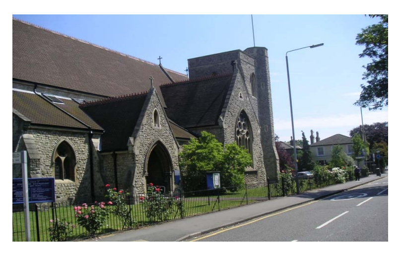
View eastwards of St John's Church along Grove Lane

6.27 St John's Church is a key landmark/focal point for the area. It is well framed by the surrounding greenery and railings, whilst the approach to the building is impressive from any one of four roads that lead into this area. Views looking northwards frame the church against the striking vicarage building at No.15 Springfield Road. The former Vicarage of St Johns (1903) is an important part of the setting for the church.