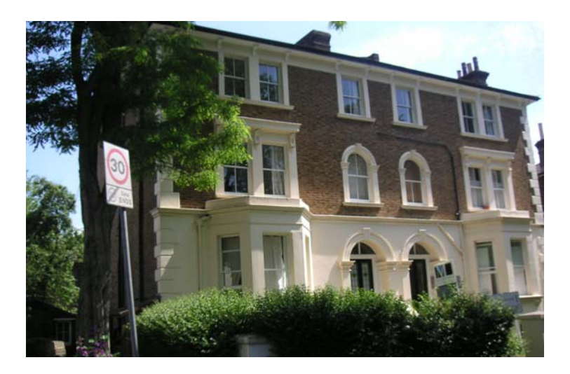
3-5 Grove Crescent (north)