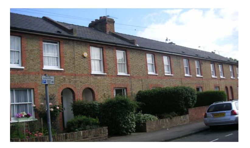
4 - 14 Bloomfield Road

6.22 The Springfield Grove Estate is characterised by small scale artisan cottages built between 1865 and 1895. The smaller, terraced houses on Portland Road (nos 21-35) and Bloomfield Road (nos 4-14, 15-23) are built of yellow London stock bricks and finished with simple red dressings. Typical features include original sash windows and arched doorways with brick lintels around the arches.