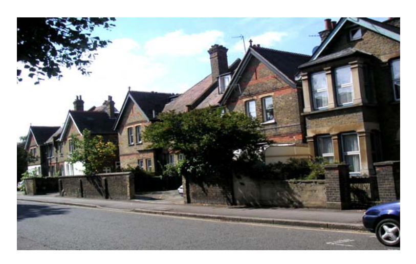
46 - 52 Grove Crescent, 4 Denmark Road