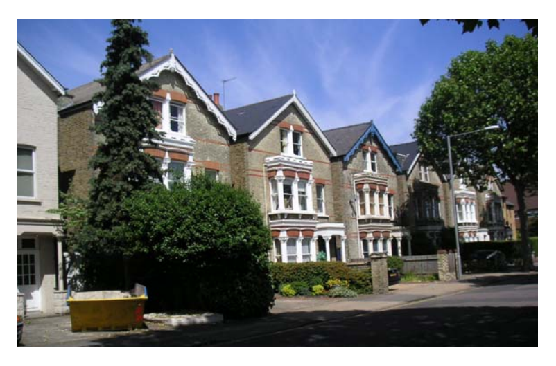
14 - 16 Beaufort Road

6.45 The southern section of Fassett Road and nos 6-20 Beaufort Road were developed in a series of blocks in Victorian Gothic styles with leaf foliage capitals. The majority of the buildings have kept their original doors and windows and a number of the later buildings are faced in off-white gault bricks.