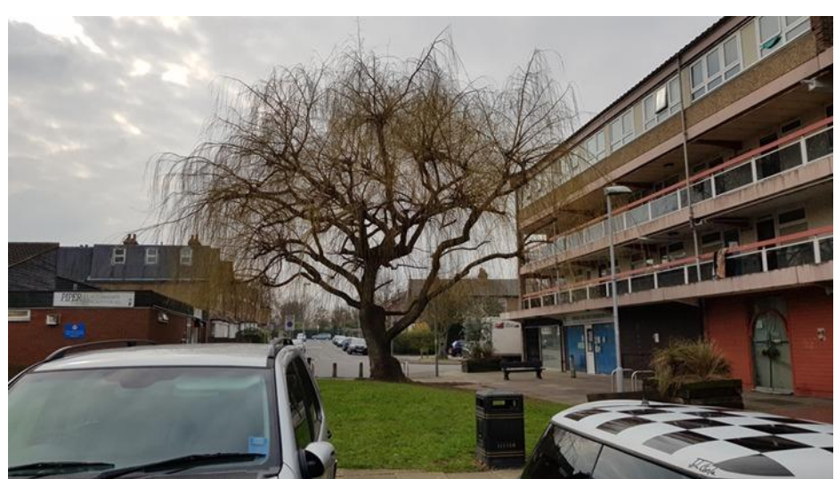
T23 looking south