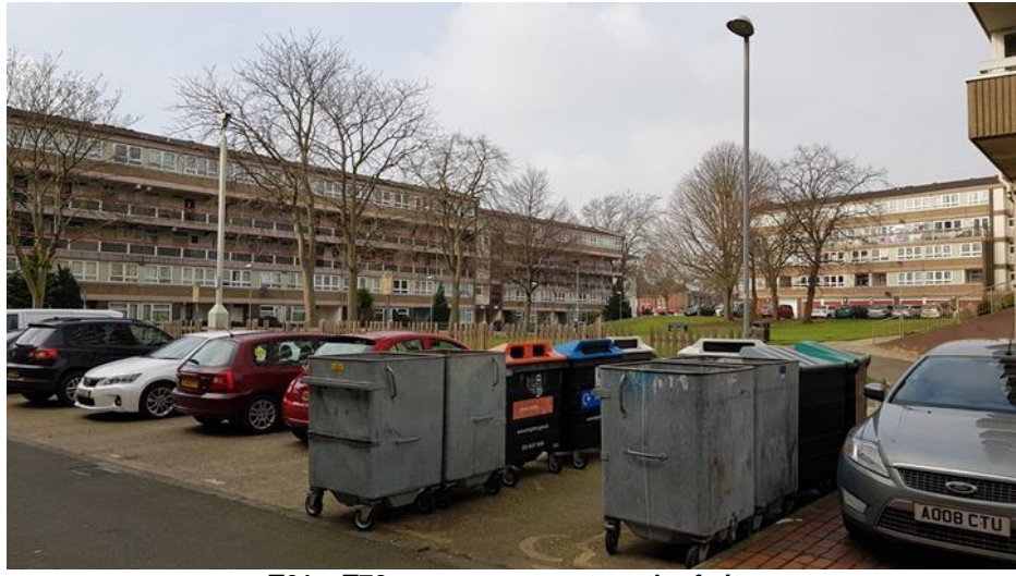
T61 - T70 on grass area at north of site