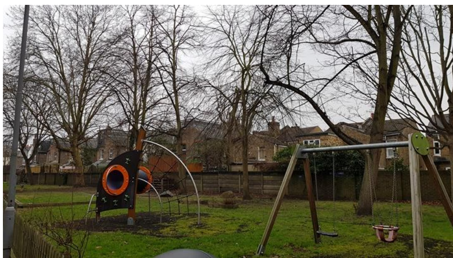
Trees on western boundary T43 - T48 (L - R)