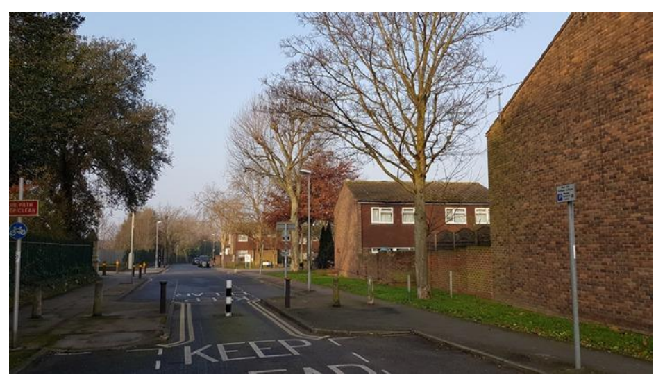
Trees on southern boundary T1 - T13