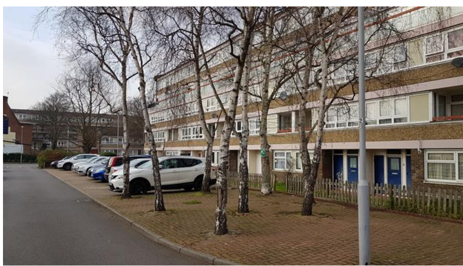
Example of lower quality C category trees within site (G3)