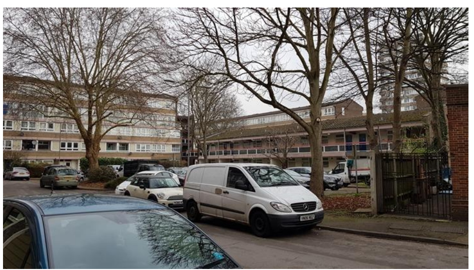
Trees in Fordham car park T36 - T42 (R - L)