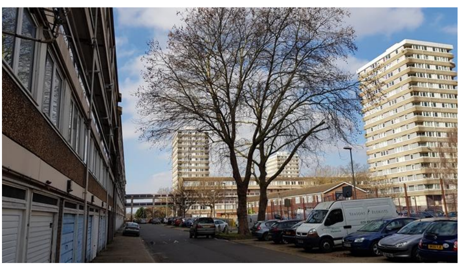
T111 & T112