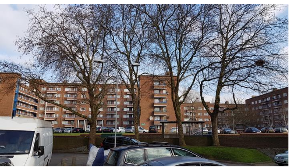
Trees on north eastern boundary (T91 - T94)