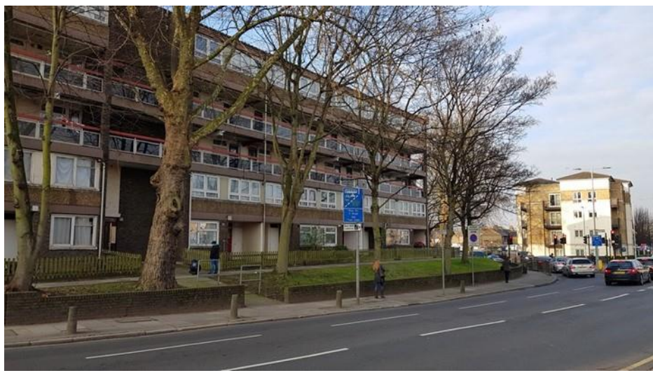
Trees on northern boundary (T77 - T82)