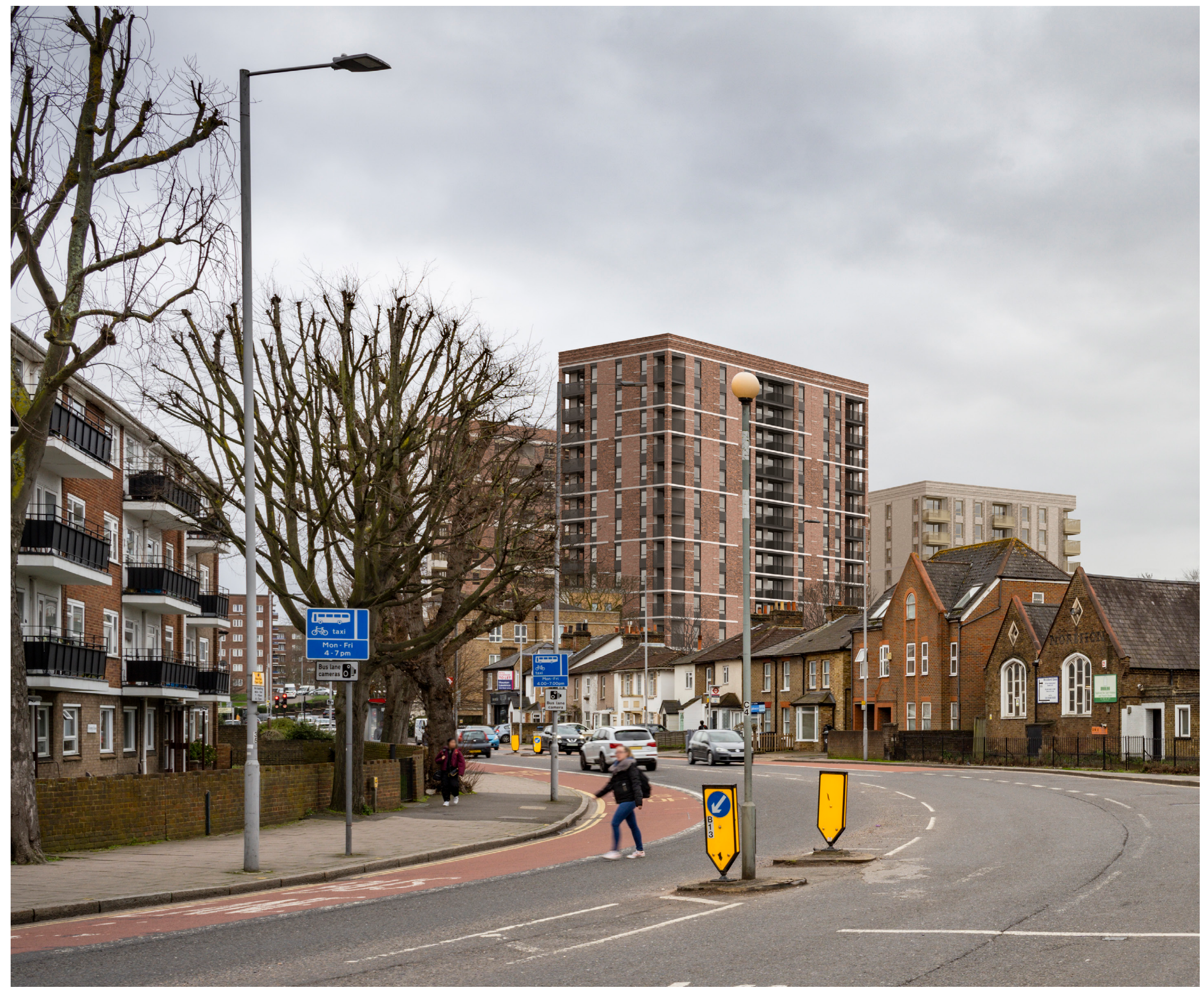
Figure 0.1: Townscape view of Development Plot C from Cambridge Road approaching from Kingston.