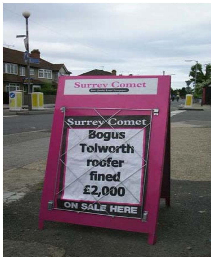
Publicity given to Rogue Trader

There continues to be close links with Kingston Police and information is regularly shared particularly concerning premises alleged to be selling alcohol to children. Officers are also planning a joint training exercise on doorstep sellers, such as those offering to fix a supposedly loose tile or resurface a driveway, that prey on older people.