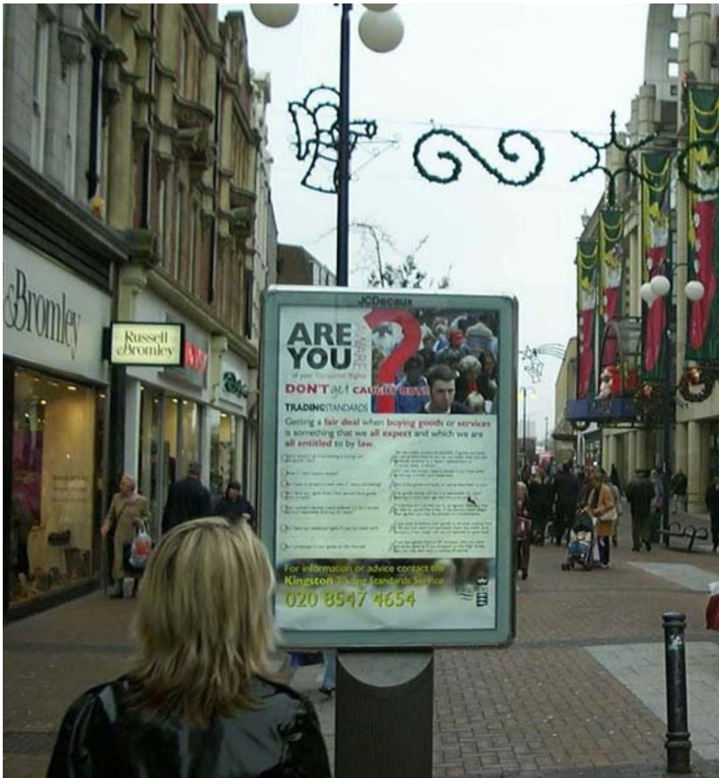
Town Centre poster giving basic consumer advice

As always the coming year will continue to be a challenging one.