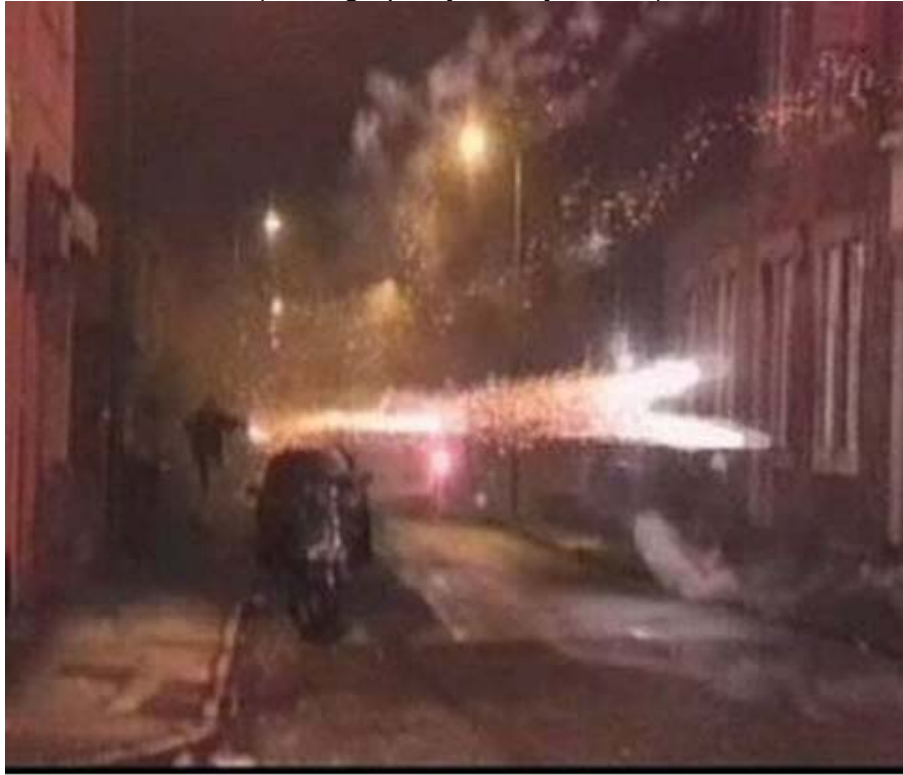
Hooligan misusing a Category 3 Firework