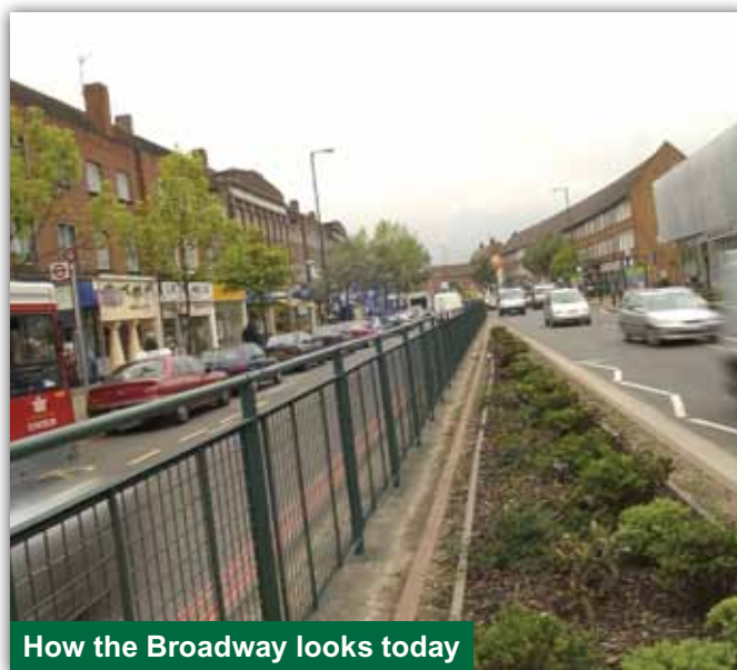
How the Broadway looks today

The other primary aim is to allow freedom to cross Tolworth Broadway at any point; the widened island will also enable pedestrians and cyclists to travel along the centre of the road between Ewell Road