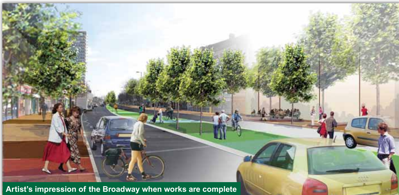
Artist's impression of the Broadway when works are complete

A new signal controlled crossing will be provided in Kingston Road to allow access to both the Charrington Bowl and the Sunray Estate sides of the road.