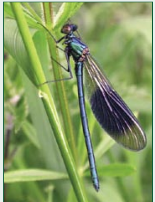
Banded Demoiselle dragonfly