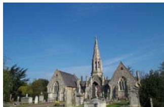
Victorian twin gothic style chapels.

The grounds, Remembrance & Floral Chapels are open every day of the year at the following times: