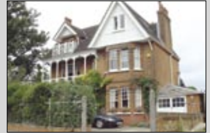
Lower Ham Road, Kingston.