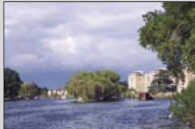
View north of Lower Ham Road, Kingston.