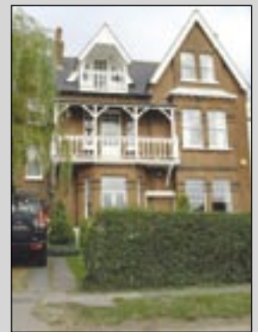
Lower Ham Road, Kingston.