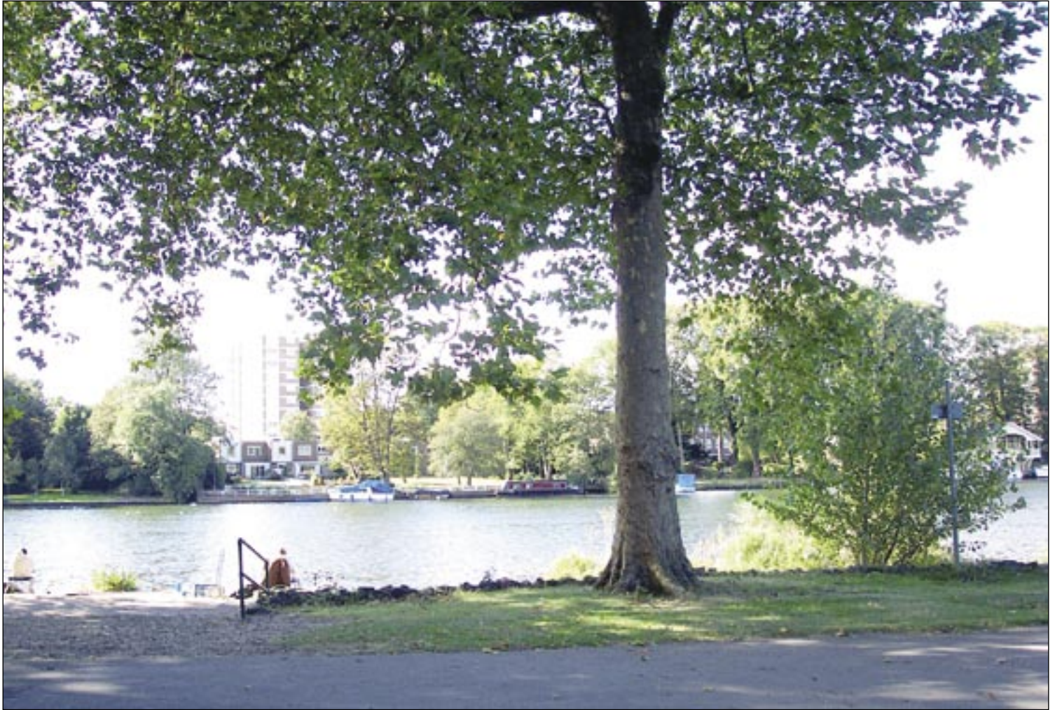
View west from Canbury Gardens towards Richmond.

Planning Information and Summary Character Appraisal