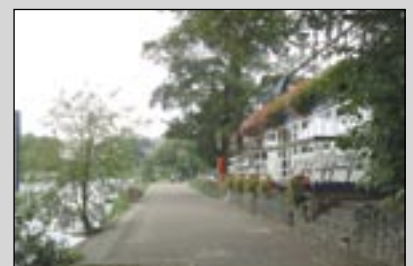
The Boaters Inn, Canbury Gardens, Kingston.