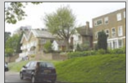
Lower Ham Road, Kingston.