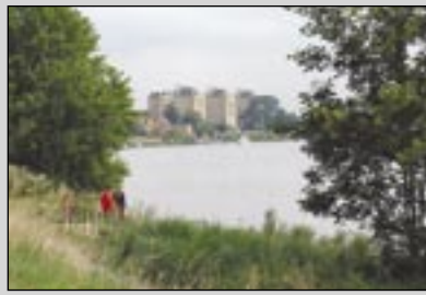
View south of Lower Ham Road, Kingston.

A detailed character appraisal and background reports to the designation are available on the website at: www.kingston.gov.uk/riverside_north_ca