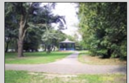
The Bandstand, Canbury Gardens.