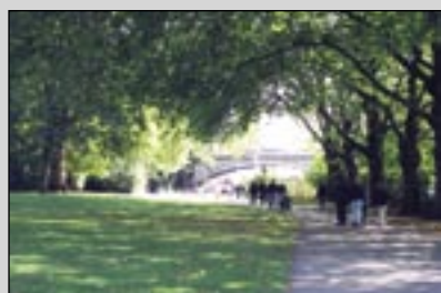
View south to Kingston Railway Bridge from Canbury Gardens.