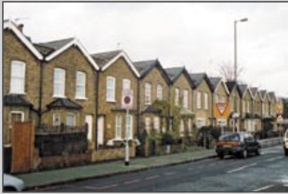
Beverley Cottages, Kingston Vale.