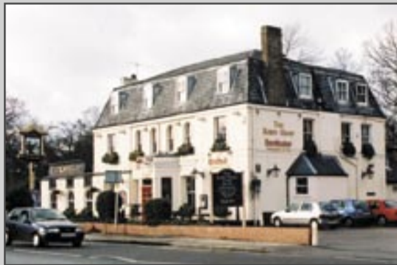
Robin Hood Hotel, Kingston Vale.