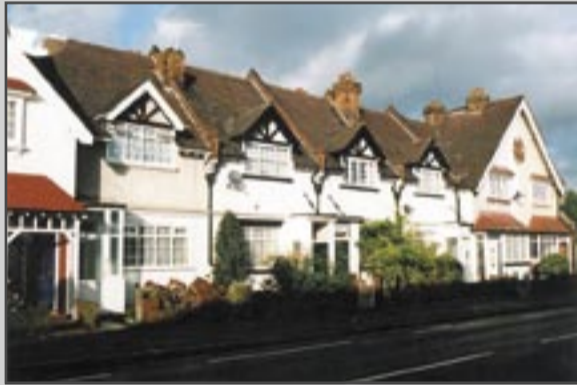
Vale Cottages, Kingston Vale.