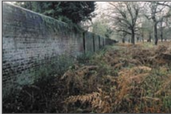
Wall to Richmond Park.