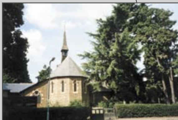
St. John The Baptist Church, Robin Hood Lane.