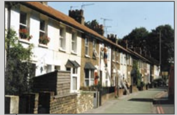
Ebor Cottages, Florence Terrace, Kingston Vale.