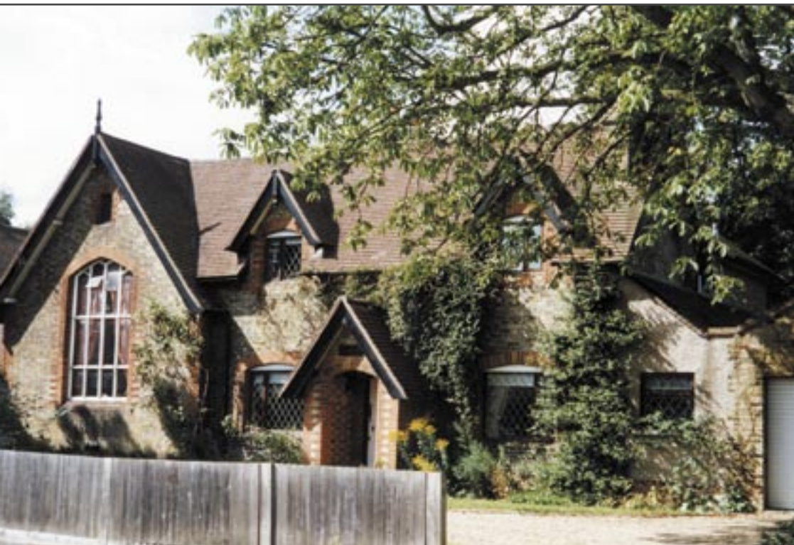
The Old School House, Robin Hood Lane.