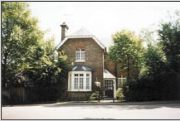
Robin Hood Gate Lodge.