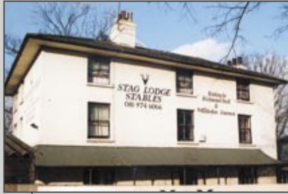
Stag Lodge Stables, Kingston Vale.