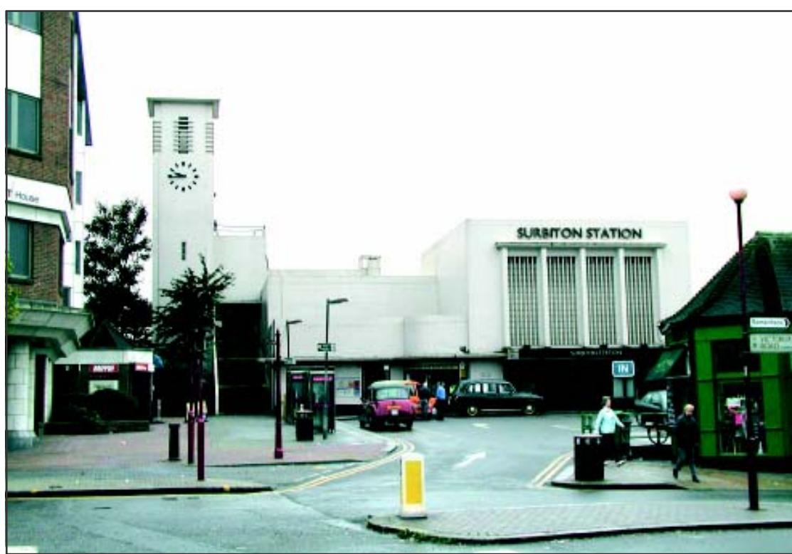
Surbiton Station, Victoria Road (listed building).