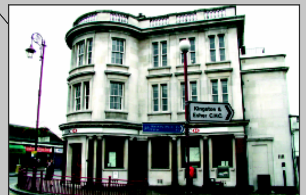
Corner of St. James Road & Victoria Road.