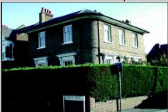
Poplar Grove. / Acacia Grove.