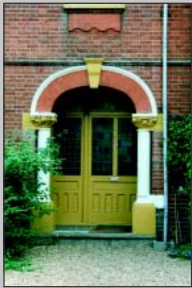
Presburg Road; front door detail.