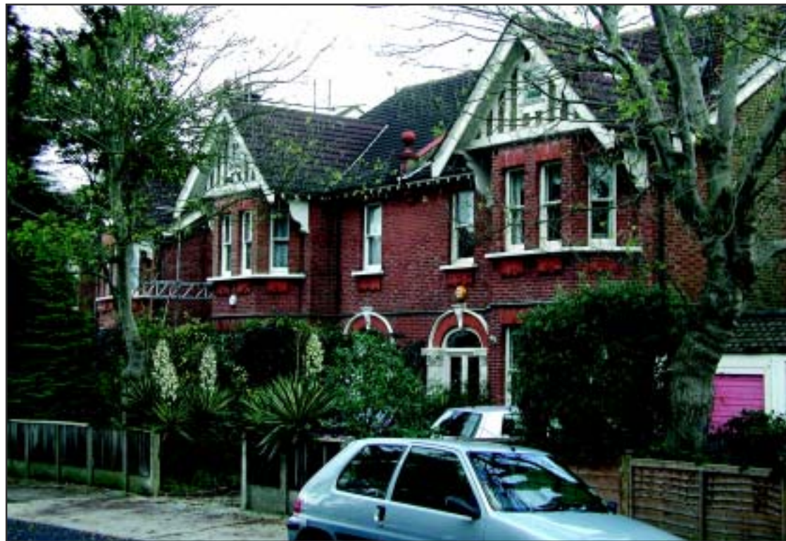
Presburg Road.