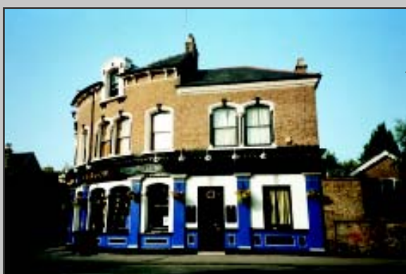
Norbiton and Dragon Public House, Clifton Road.