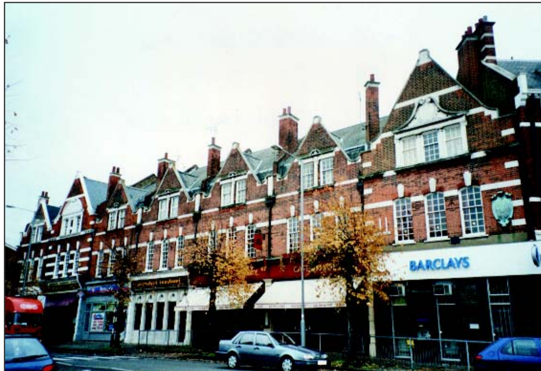
Kingston Hill - local shops..