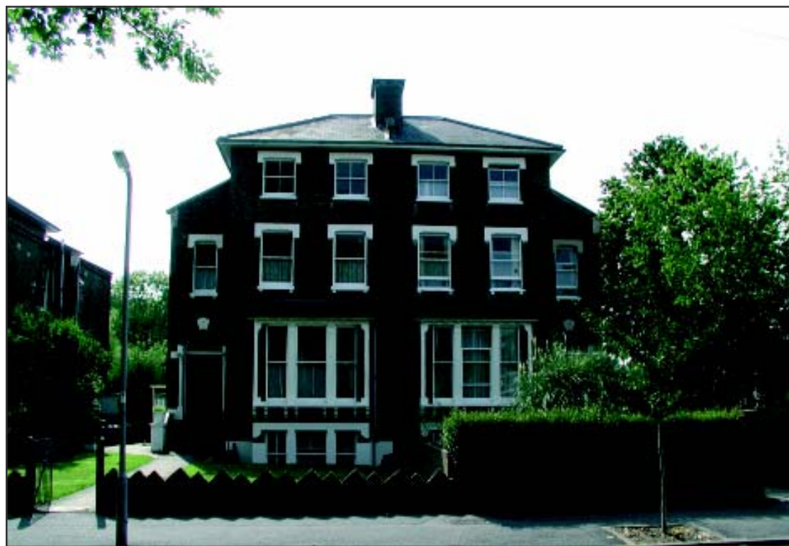
Christchurch Road