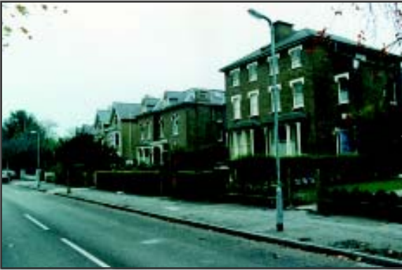
Christ Church Road.