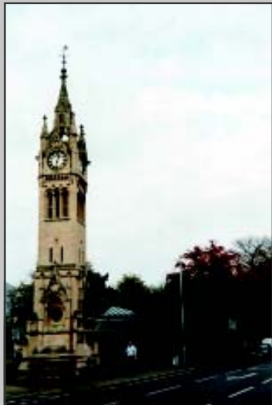
The Clock Tower (listed building).