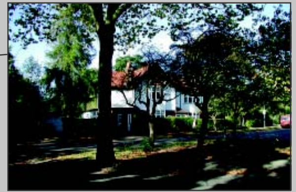
Junction of Langley Avenue and Ashcombe Avenue