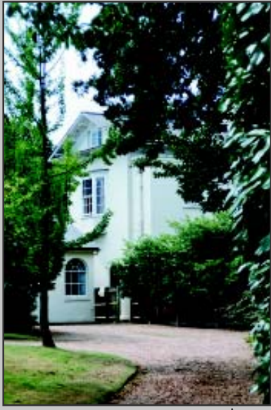
Southborough Lodge, Ashcombe Avenue.