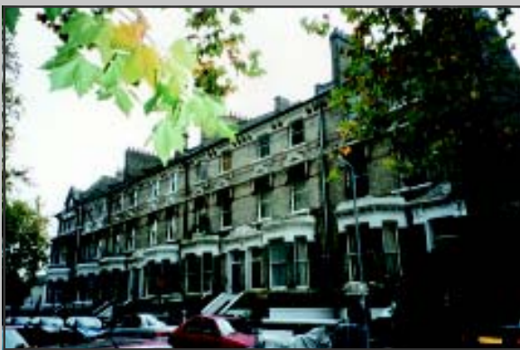
St. Andrews Square.