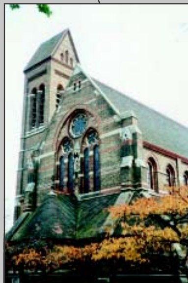
St. Andrew's Church.