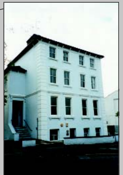
St. James Road.