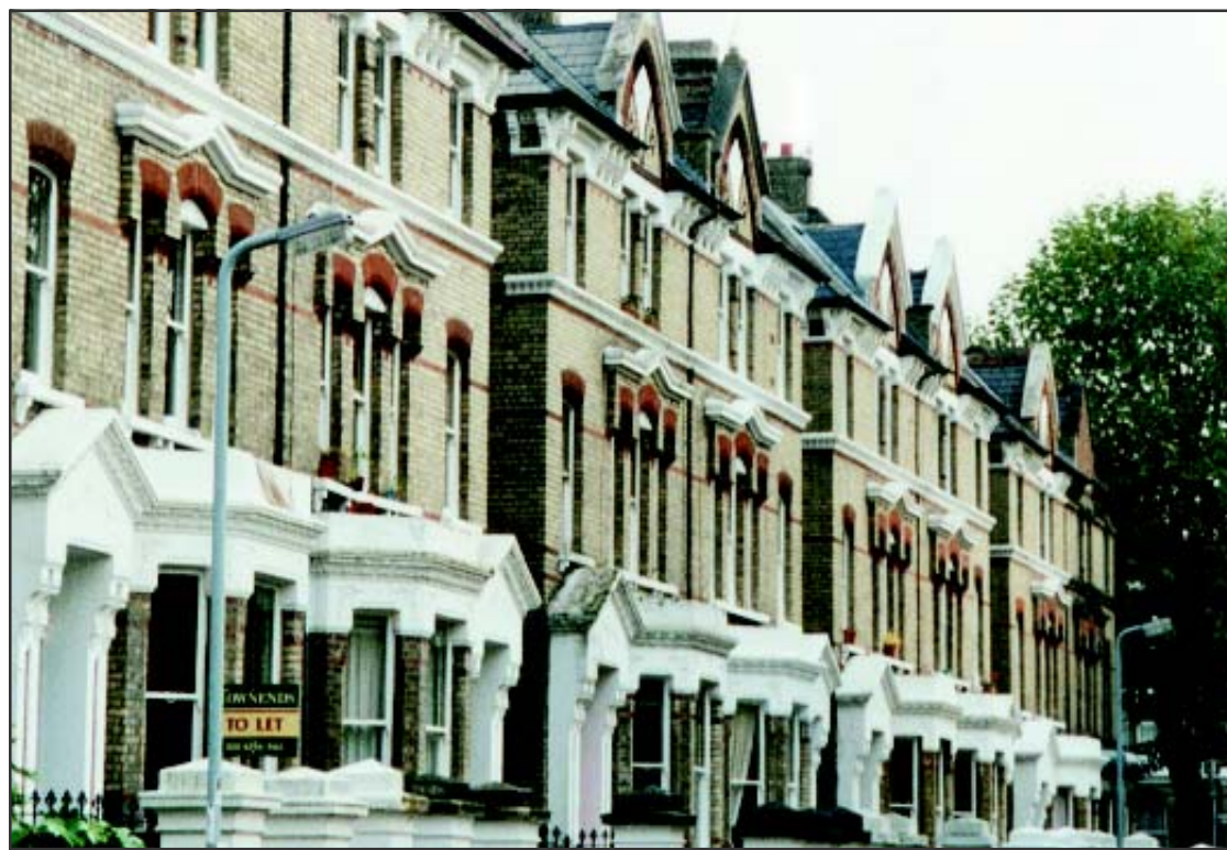
St. Andrews Square.