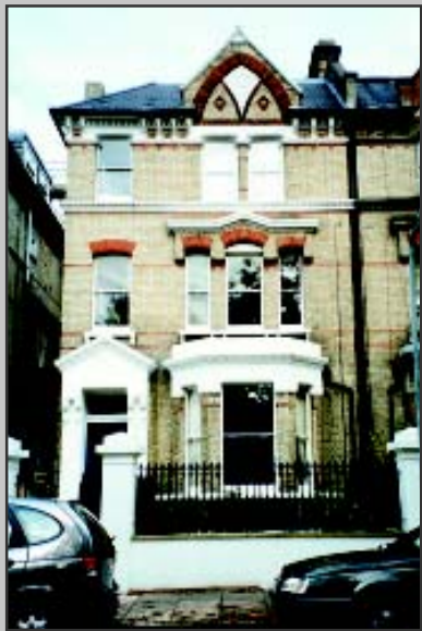
St. Andrews Square.