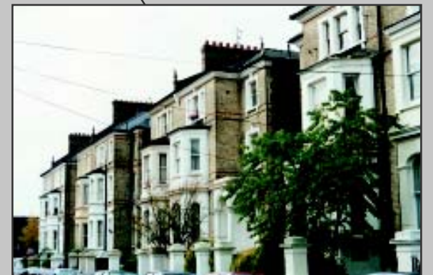
St. Philip's Road.

For further information and advice on the St. Andrews Square Conservation Area please speak to a Conservation Officer on 020 8547 4706/5316.