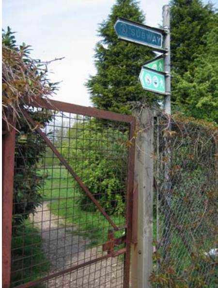
Above: Signage at the gate by the A3