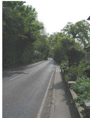
The gate out of The Hollows onto Church Road (left) and the end of the pavement at the start of Old Malden Lane (right)

Neither of the routes from The Hollows is ideal. The strategy highlights the importance of finding a safe and attractive route from Knollmead. Initially the proposed route was to follow the river parallel to Old Malden Lane. The path for this route is in a number of different ownerships, and although officers have sought to secure a walk along this route it seems unlikely in the foreseeable future. However, this situation will be monitored and potential opportunities regularly reviewed.